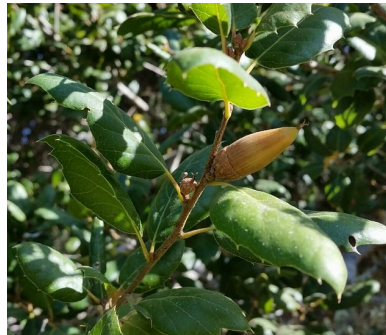
Coast live oak