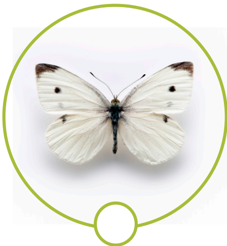
CABBAGE WHITE Pieris rapae