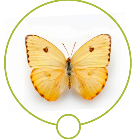
CLOUDLESS SULPHUR Phoebis sennae