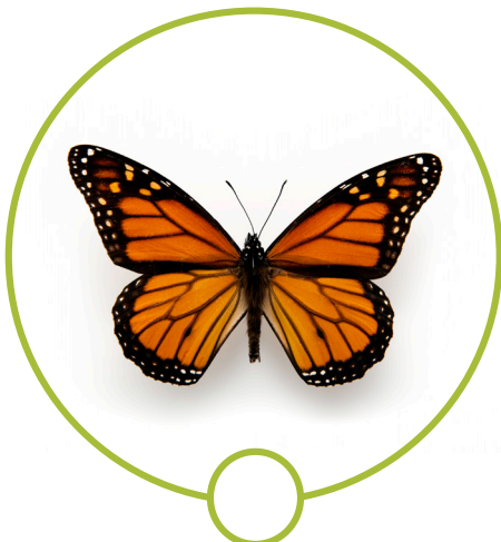
MONARCH Danaus plexippus