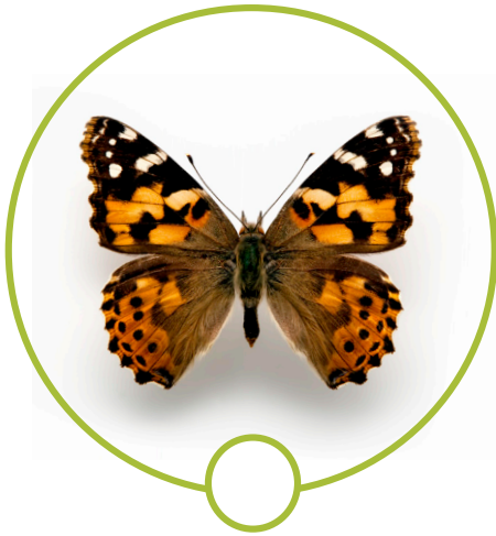
PAINTED LADY Vanessa cardui