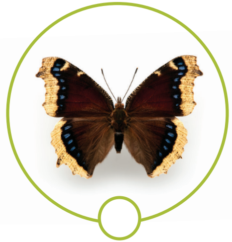
MOURNING CLOAK Nymphalis antiopa